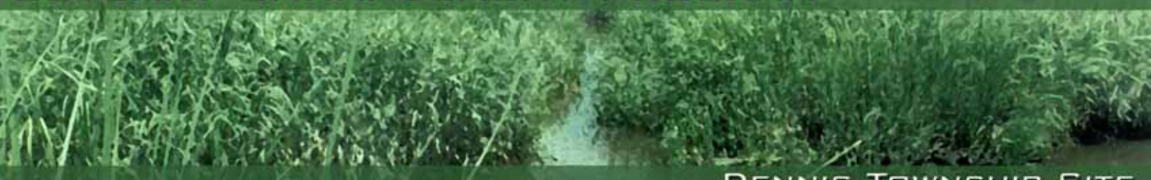
DENNIS TOWNSHIP SITE